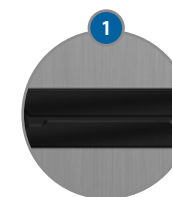
Magnetic stripe reader